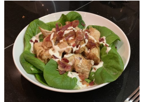
(A grilled chicken salad made with our organic butter lettuce.)

our greenhouse. All 100% Organic, local, sustainable, and beautiful. Give us a call to find out more!